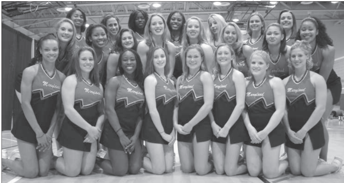
TABLE OF CONTENTS MARYLAND CHEERLEADING QUICK FACTS