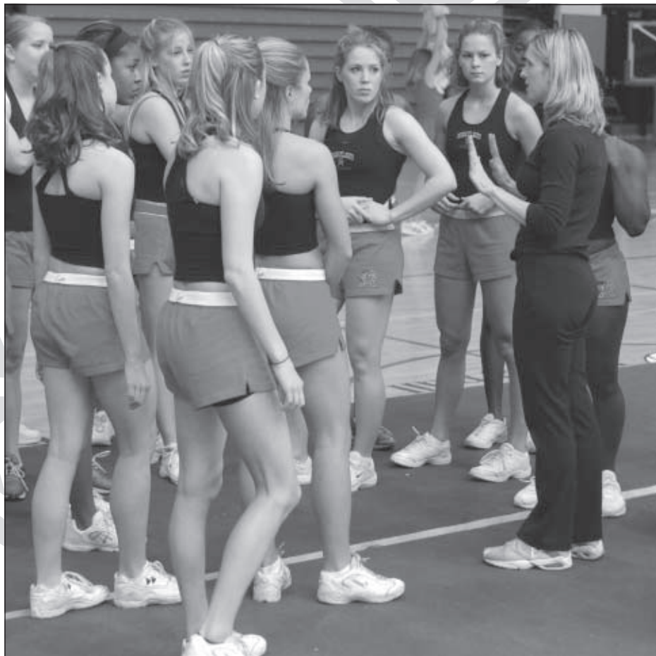
Fleece with the Terps prior to a practice session.